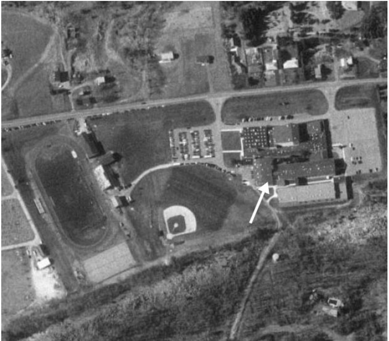
Aerial View of Palmerton Area High